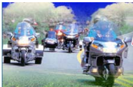
Guided and self-guided rides