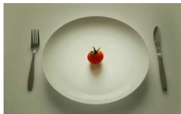
Lots of Great Food!!!