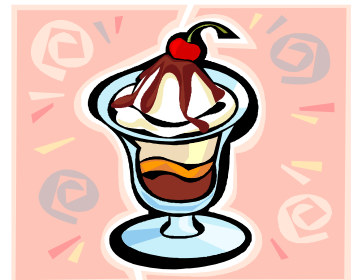
Build your own Sundae!